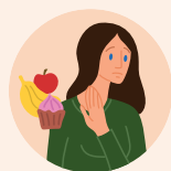
Loss of Appetite